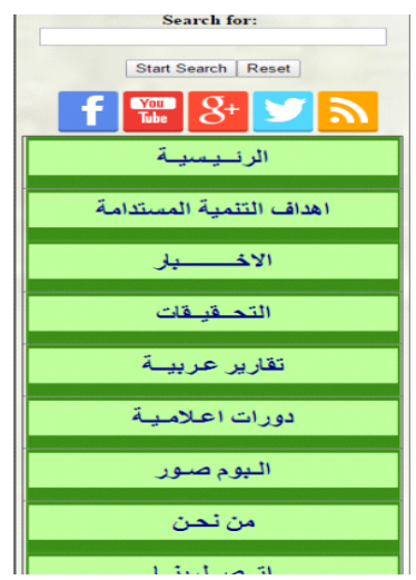
Fig.7 the side bar

The side bar include 10 buttons linked to different web pages in the site search form use to search about any word in the site shown in Fig. 7.