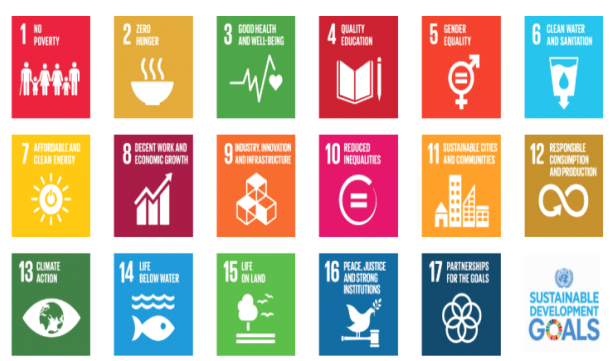
Fig. 3 SDGs

Goal 17: Strengthen the means of implementation and revitalize the Global Partnership for Sustainable Development [1] as shown in Fig. 3.